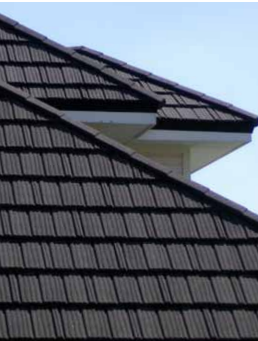
Panel Coating Layers